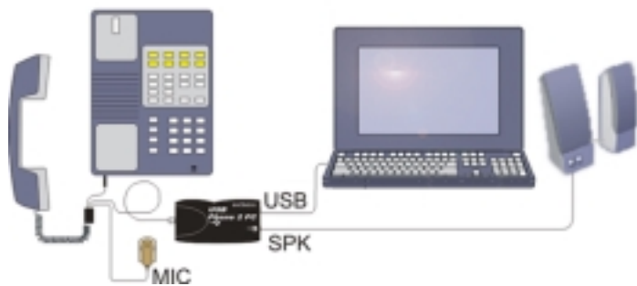
Phone 2 PC Interface