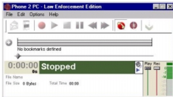
Phone 2 PC – Law Enforcement Software