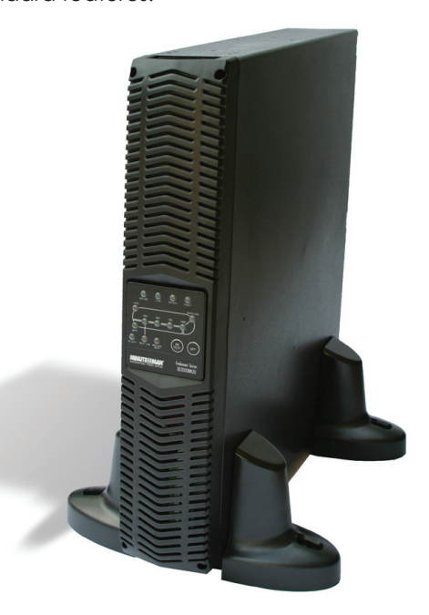
Endeavor UPS Model ED2000RM2U with tower mount stand provided (standard)

In developing one of the best-valued, highest quality UPS products on the market, the Endeavor Series has these standard features: